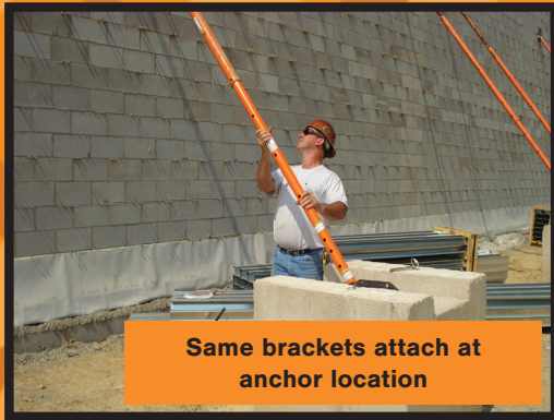
Same brackets attach at anchor location