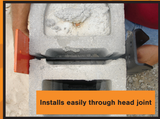
Installs easily through head joint