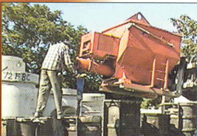
Shown in use at DiCicco Concrete Co. Chicago Heights, Illinois.