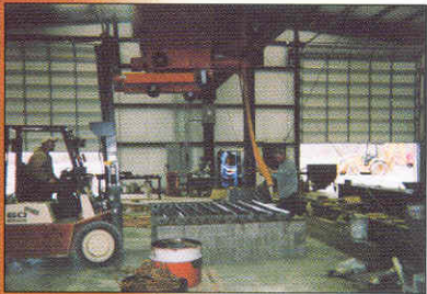
Shown in use at Tankersley Concrete Co. Lewisburg, Tennessee.